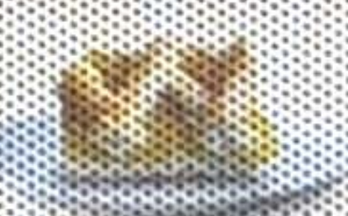
Pineapple Tart $7