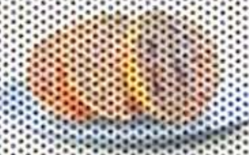
Guava Duff $8