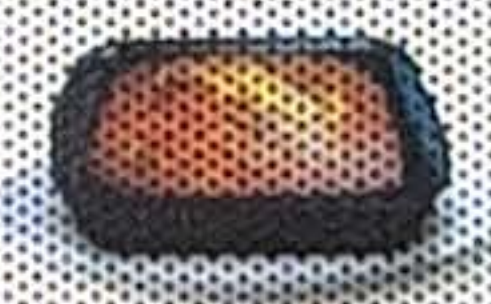
Banana Bread $6