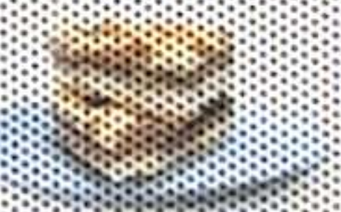
Coconut Tart $7