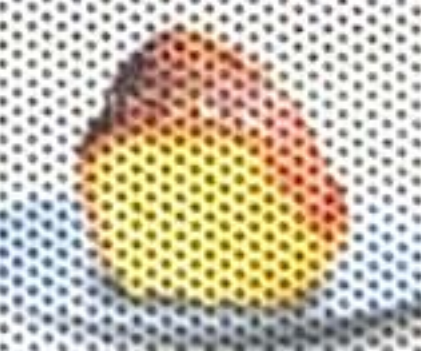
Rum Cake $7