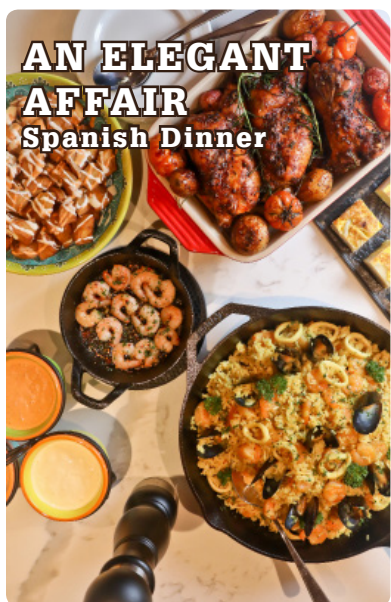
AN ELEGANT AFFAIR Spanish Dinner

An Elegant Affair - Spanish Dinner 6:00PM - 8:00PM