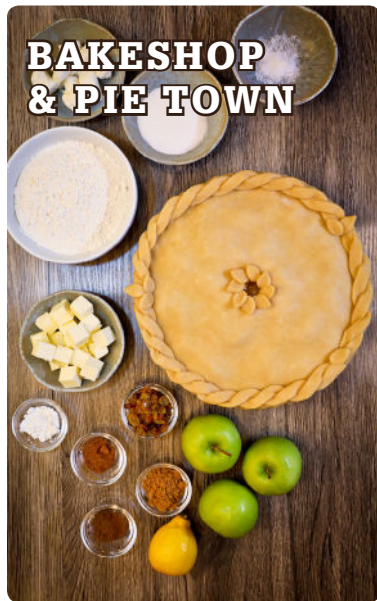
BAKESHOP & PIE TOWN