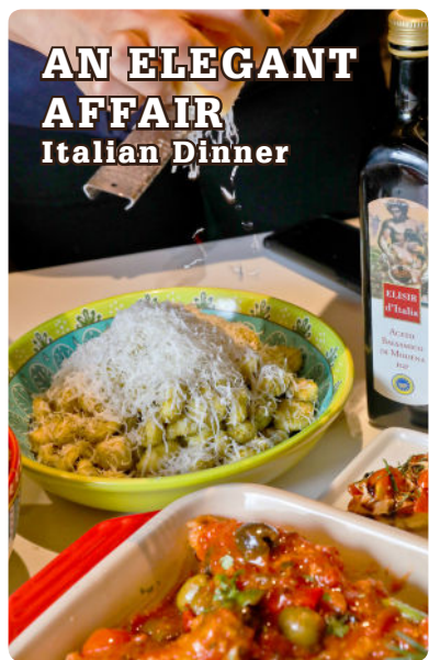
AN ELEGANT AFFAIR Italian Dinner

An Elegant Affair - Italian Dinner 6:00PM - 8:00PM