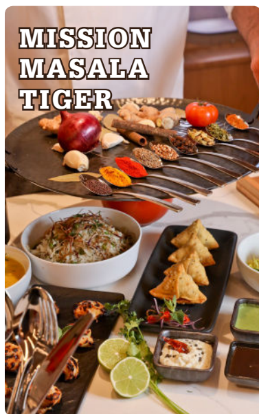
MISSION MASALA TIGER