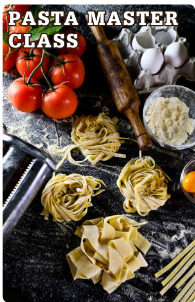
PASTA MASTER CLASS