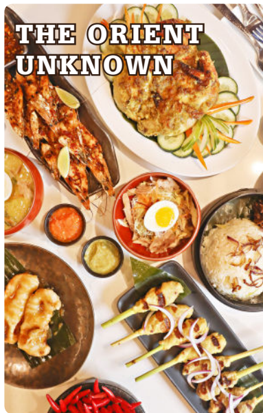
THE ORIENT UNKNOWN