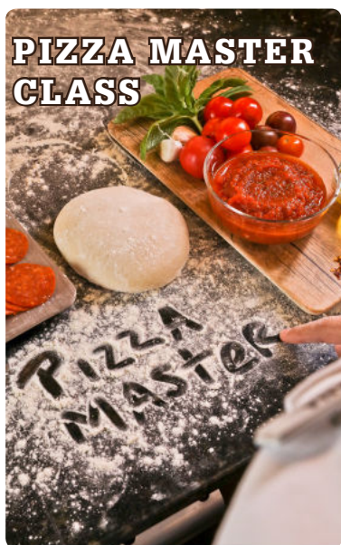
PIZZA MASTER CLASS