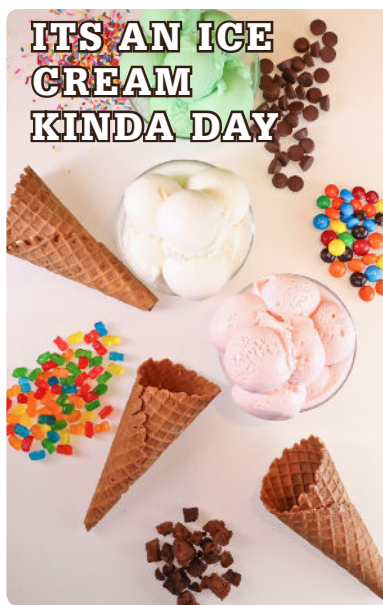
ITS AN ICE CREAM KINDA DAY