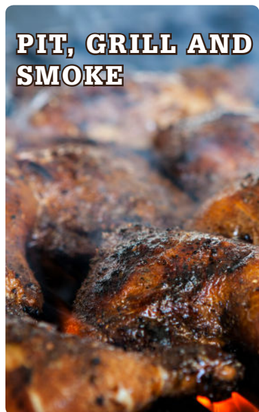
PIT, GRILL AND SMOKE